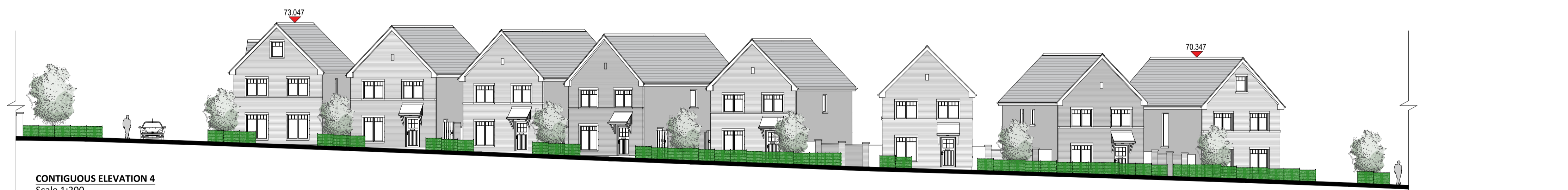
CONTIGUOUS ELEVATION 4 Scale 1:200