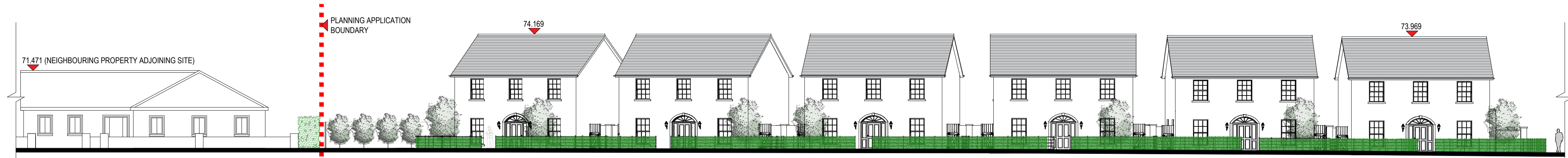
CONTIGUOUS ELEVATION 1 - (VIEW ALONG KILDALKEY ROAD) Scale 1:200

COPYRIGHT THIS DOCUMENT AND ALL DATA CONTAINED HEREIN REMAIN THE PROPERTY OF O'DALY ARCHITECTS. IT IS SUPPLIED IN CONFIDENCE FOR EVALUATION PURPOSES ONLY UNDER THE CONDITION THAT SAME IS NOT USED, REPRODUCED OR TRANSMITTED IN ANY WAY TO OTHERS WITHOUT WRITTEN CONSENT. DIMENSIONS UNLESS OTHERWISE STATED, DIMENSIONS SHOWN ARE IN MILLIMETRES. NO DIMENSIONS TO BE SCALED FROM THIS DRAWING. ALL DIMENSIONS TO BE CHECKED BY THE CONTRACTOR ON SITE AND ANY DISCREPANCIES TO BE REPORTED TO THE ARCHITECT.