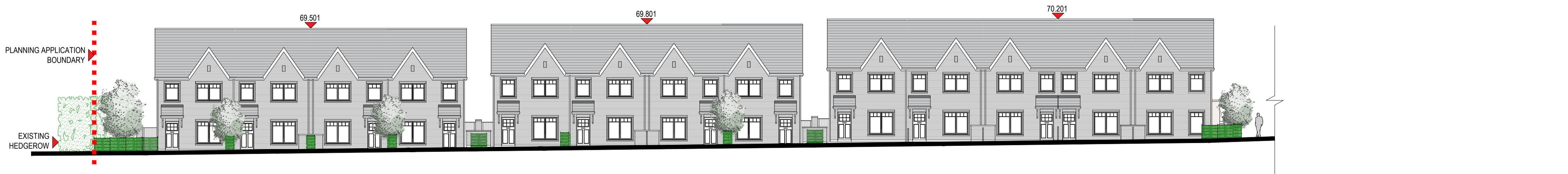
CONTIGUOUS ELEVATION 6 Scale 1:200