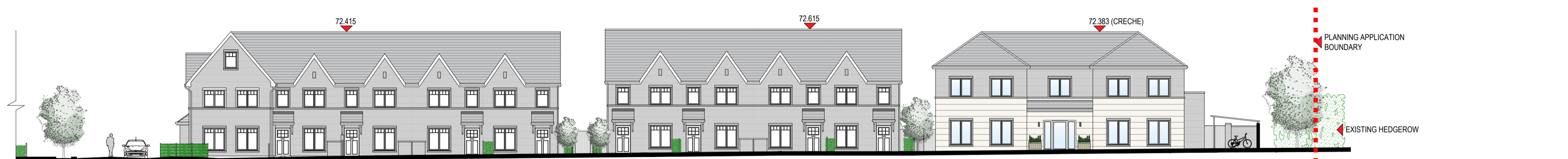
CONTIGUOUS ELEVATION 3 Scale 1:200