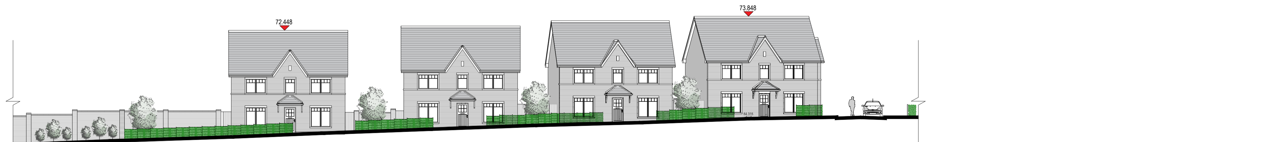
CONTIGUOUS ELEVATION 5 Scale 1:200