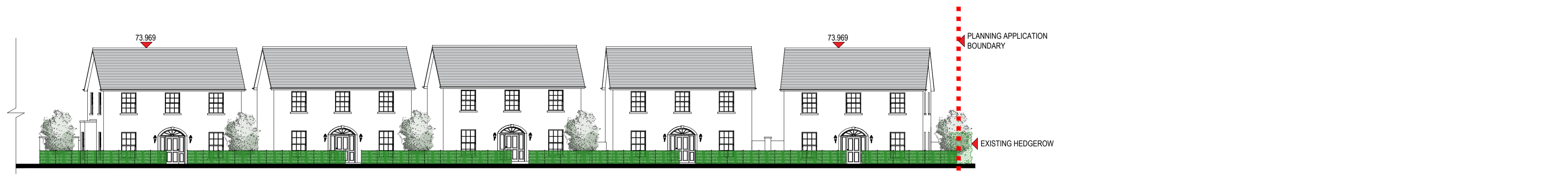
CONTIGUOUS ELEVATION 2 - (VIEW ALONG KILDALKEY ROAD) Scale 1:200